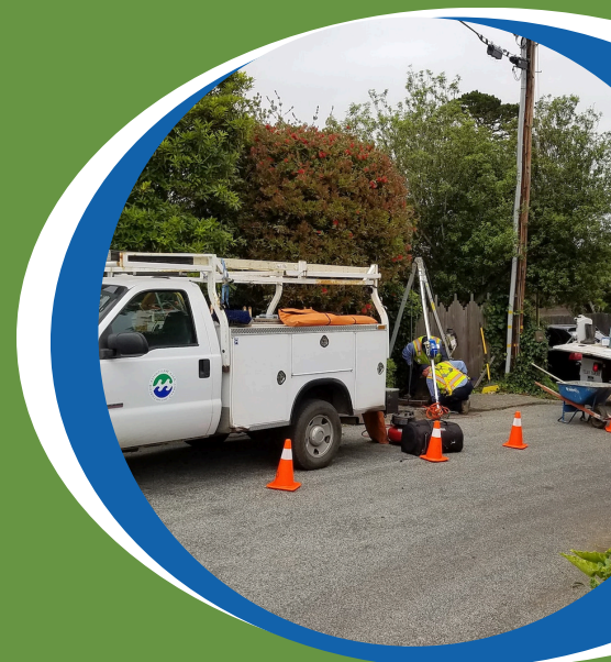
CAWD at Work