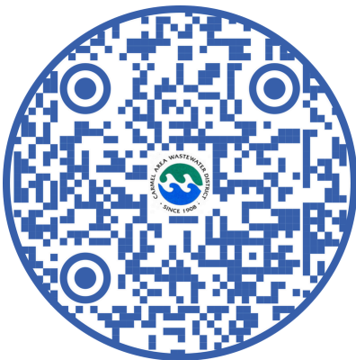
Project Information Page

For more information on the project and your sewer system, scan the QR codes below